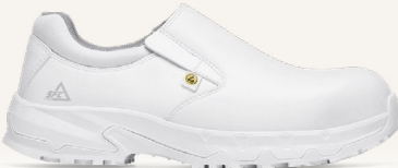
Brandon NCT White: 76643